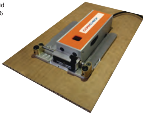
CORRCHECK-the ideal measurement tool for corrugated board

TOSI Packaging Solution www.tosijasindo.com tosijkt@cbn.net.id +62 21 75902726