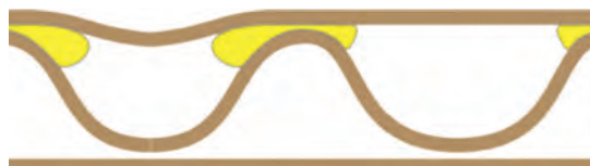
Relationship between amount of starch and washboard effect