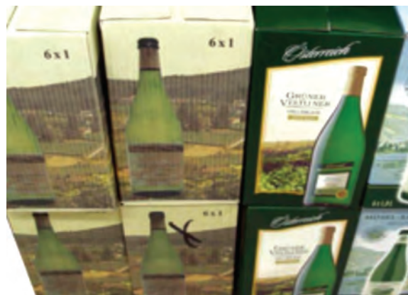
Washboard effect and fluting defects on packaging could be seen as a message about the quality of the product itself.

To meet this requirement PERET has developed the CORRCHECK-Corrugated Checker. It's a camera based, hand-held tool that measures the surface of corrugated in a non-contact manner. In a few seconds, the microscopic undulating surface is analysed over approximately 40mm taking more than 6,000 depth measurements. The resulting