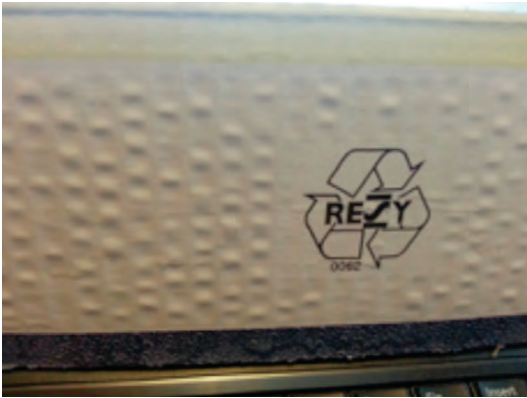
Cockling and Honeycomb effect due to excessive moisture

TOSI Packaging Solution www.tosijasindo.com tosijkt@cbn.net.id +62 21 75902726